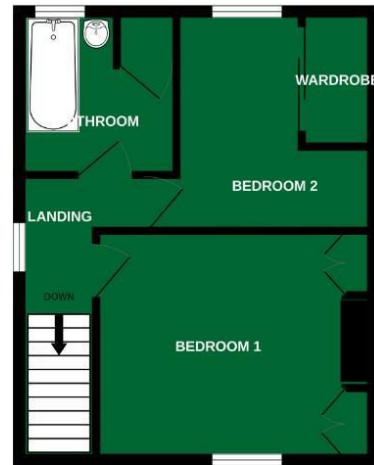
1ST FLOOR 32.8 sq.m. (353 sq.ft.) approx.